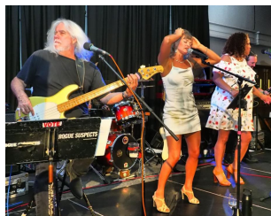
The Rogue Suspects and Dream Ball