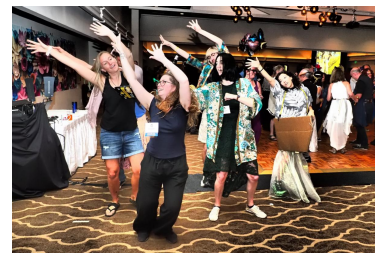
Dream Ball