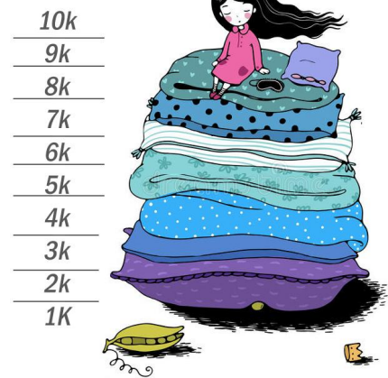
Pledge Drive 2020

Thank you all, and the very best of dreams! Together we make dreams come true. Click here for a list of Pledge Donors .