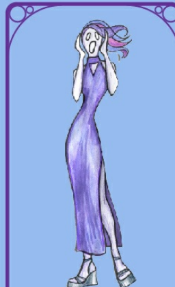
THE SCREAMER DREAMER

THAT CREEPY SHADOW FIGURE FROM THOSE NIGHTMARES. METHOD: DON'T SHOWER, BRUSH HAIR, OR CHANGE CLOTHES FOR A YEAR. SUPER MONEY SAVER!