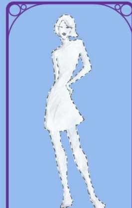
THE NO-RECALL NO DREAM-BALL

THAT NIGHTMARE WITH ALL THE CHASING AND YOWLING. WEAR ANYTHING, BUT RUN SCREAMING FROM EVERYONE AT THE DREAM BALL. THEN ASK THEM FOR A GIFT.