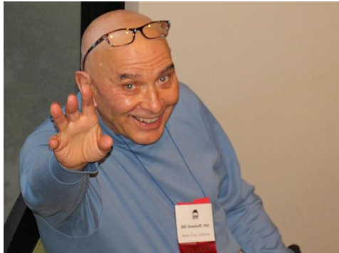
G. William Domhoff, 2017 Keynote

Conference is Free and Open to the Public