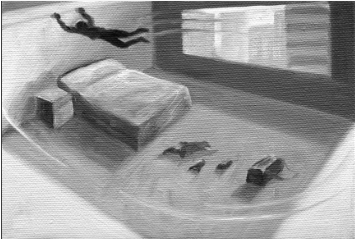
Jane Gifford, Dream Painting 9/11/01 , oil, 5" x 7"